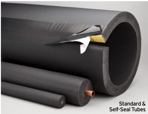
Standard & Self-Seal Tubes