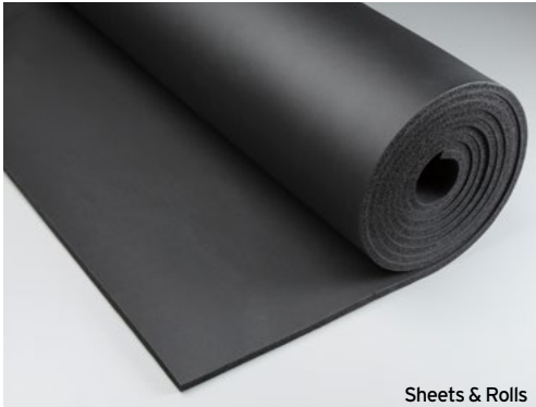
Sheets & Rolls